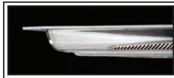
Photo of one end of domed bubble lid. Stripes identify the ← beginning of the air gap for better insulation.

The SOS Sport features an exclusive insulated lid of two layers with dead air space in-between.