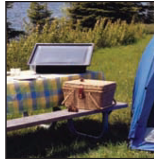
Camping and Hunting