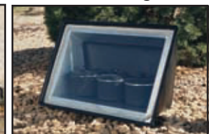
60-degree slant for a lower angle sun (early morning, later afternoon, winter)

YOU - the CHEF - can play or work while the food cooks.