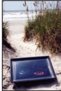
At the Beach and at Parks