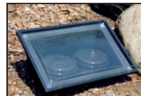
30-degree slant for direct overhead sun (mid-day, summer)

The SPORT cooks at two different angles.