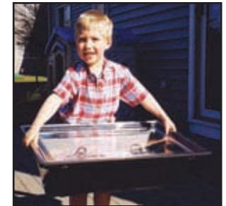
The SOS Sport is portable and weighs less than 10 lbs.

The SPORT cooks at two different angles.