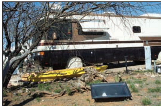
RV & SUV Campers