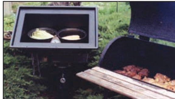
Barbecue, Patio and Gardening