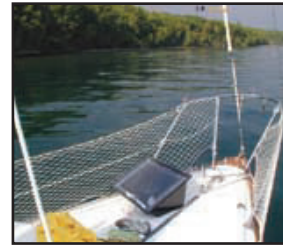
Boating, Sailing, and Fishing